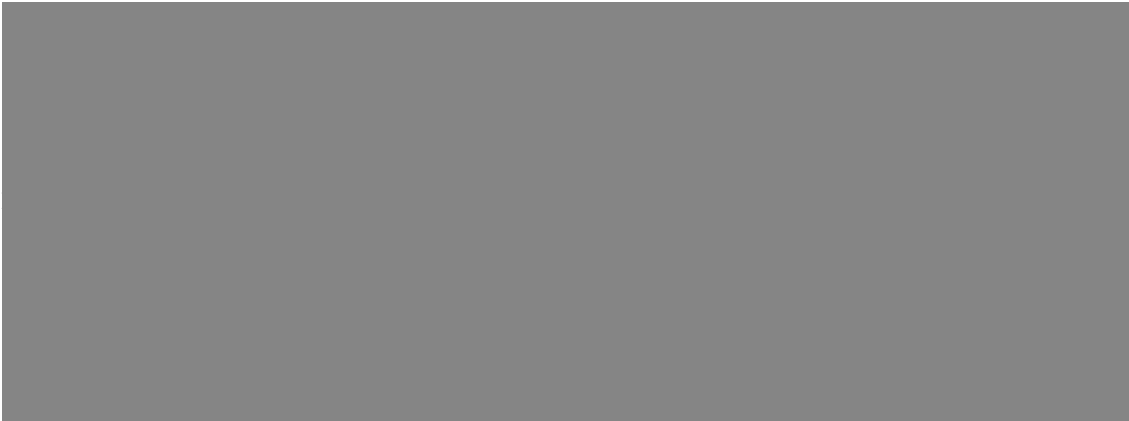
Figure 3: Problem of Perception and Approach

creative and self-driven persons are more required in this sector. However, it appears that BD Army is not basically resistant to change (FGDs). Therefore, the likely risk of success involved in this process concerns more than the likely failure. The BD Army as an organization has limited capacity of and confidence in solid waste management system. At the same time the organization has relative absence of prior experience in implementing such a system. Insufficient sensitization among stakeholders and absence of enabling environment largely depend on capacity and confidence. In case of the image building perspective, any new ideas should be welcome and resistance of change will be less. The right man in this particular climate change field is absent in the organization. BD Army do not recruit environmentalists as well as it does not have enough research capabilities and scope also. Wastage of resources in case of such a new filed will not be accepted by the organization.